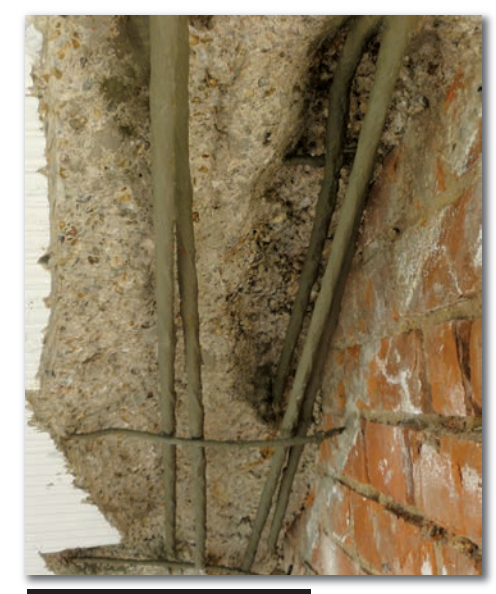
Cut back to steel reinforcements

Manufacturers offer a range of weatherproof, anti-carbonation coatings, which provide ultimate protection against carbonation, atmospheric chemicals and water ingress, whilst allowing damp substrates to breathe without blistering. Such products include the Monodex range of coatings, which have water-based, low hazard, high build formulations and are ultra-fast drying, enabling two coat applications on the same day even in UK weather conditions.