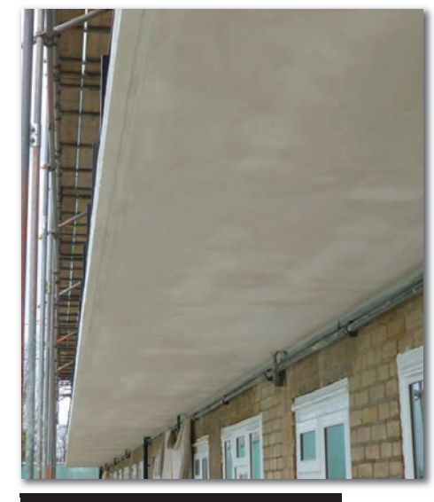
The oldest properties were built in the 1950s

Areas requiring concrete repair were treated with Flexcrete Steel Reinforcement Protector 841 and missing or removed concrete was repaired with Monomix — an advanced, single component, low density, shrinkage