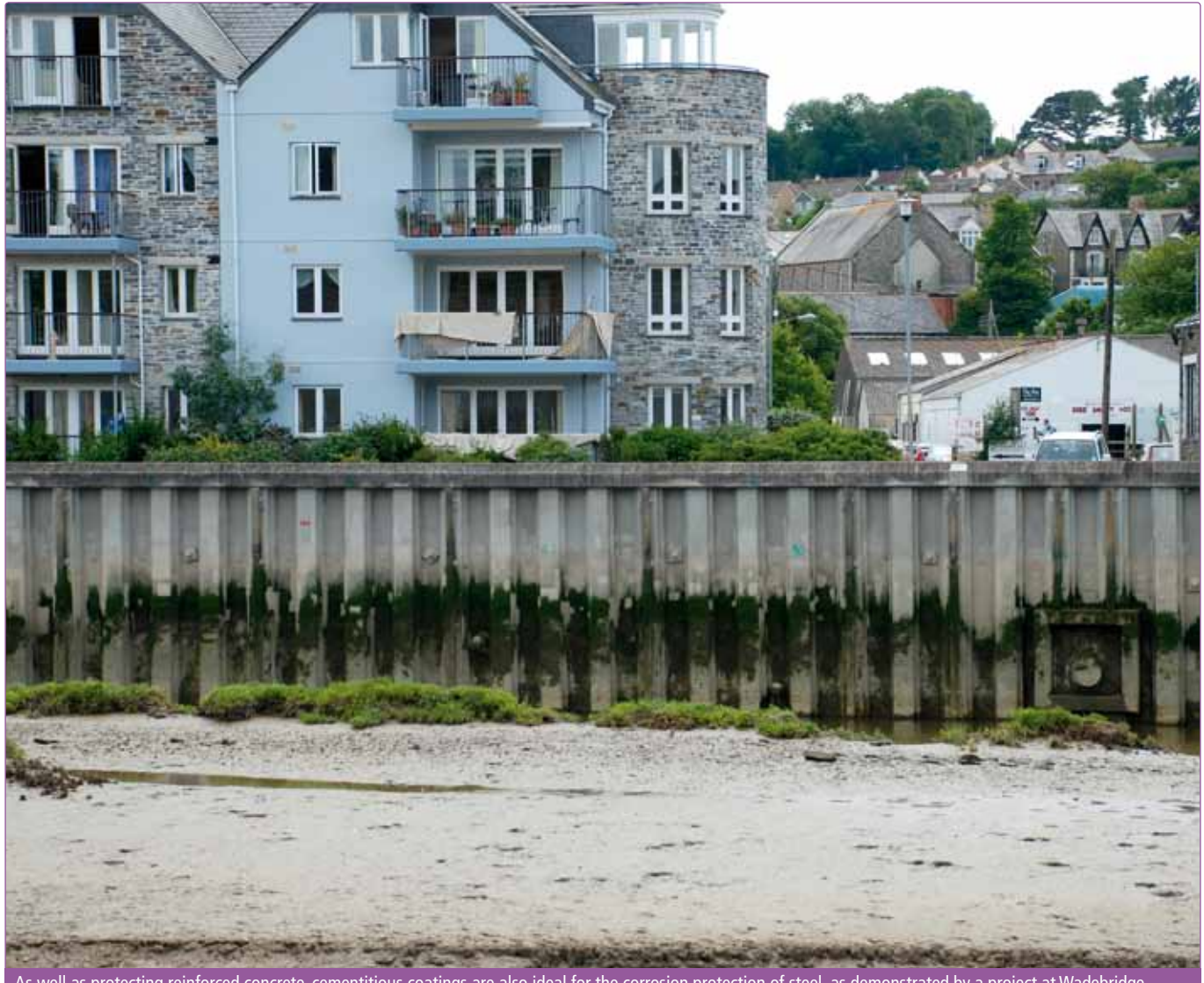
As well as protecting reinforced concrete, cementitious coatings are also ideal for the corrosion protection of steel, as demonstrated by a project at Wadebridge Estuary in Cornwall where the steel sheet piling was protected

Cementitious Coating 851 to protect the structure from chloride ingress, thereby ensuring the design life of the structure was achieved. Enhancement of 35 millimetre cover to 91 precast beams was required and a 2 millimetre coating of 851 ensured the structure was a barrier to both chloride and water ingress, providing the equivalent of 100 millimetre concrete cover. In order to blend in, the colour of 851 was matched to that of the parent concrete.